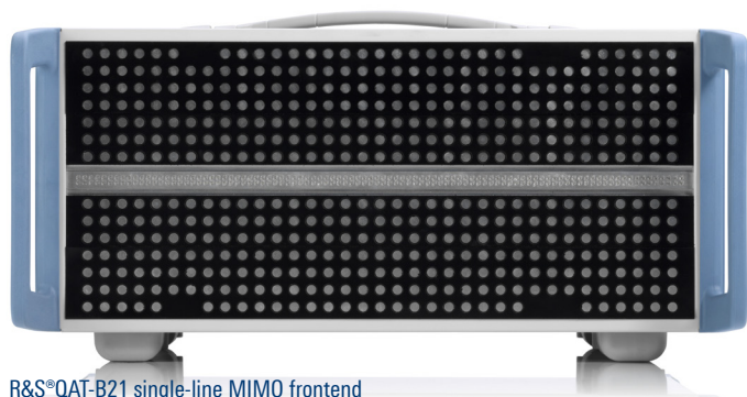
R&S®QAT-B21 single-line MIMO frontend