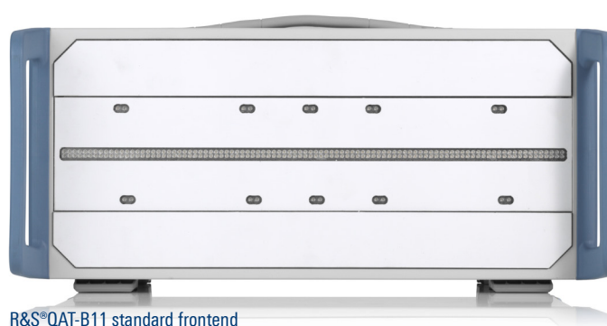
R&S®QAT-B11 standard frontend