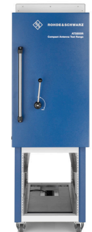
R&S®ATS800R ultra-compact CATR based 5G FR1/FR2 test chamber