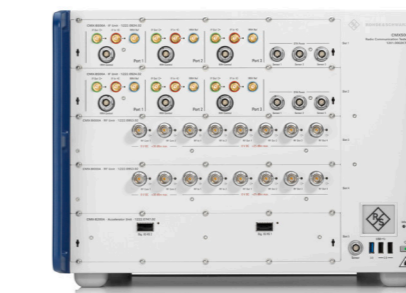
R&S®CMX500 radio communication tester