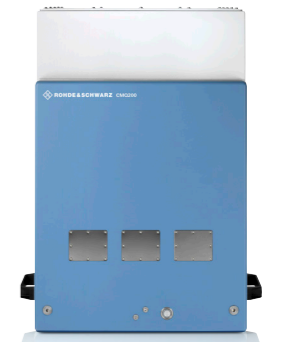
R&S®CMQ200 shielding cube