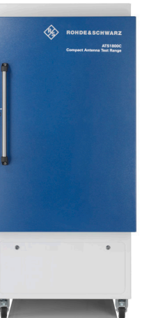
R&S®ATS1800C compact CATR based 5G FR1/FR2 test chamber