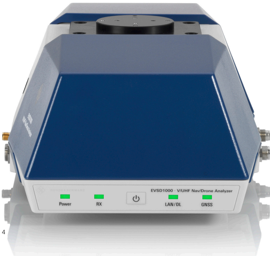
Front view of the R&S®EVSD1000 with power switch and status LEDs switched on.

The R&S®EVSD1000 automatically measures and decodes the identifier for a station under test and returns the ID pulse repetition rate, the ID code and the dash, dot and gap lengths.