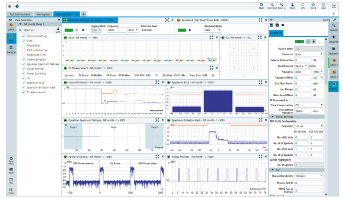
Web based GUI

The ARB generator function allows users to play pre-defined waveforms and CW signals. Any 5G NR FR2 signals can easily be generated.