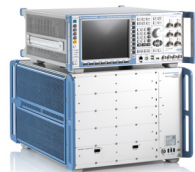
R&S®CMW minimum setup