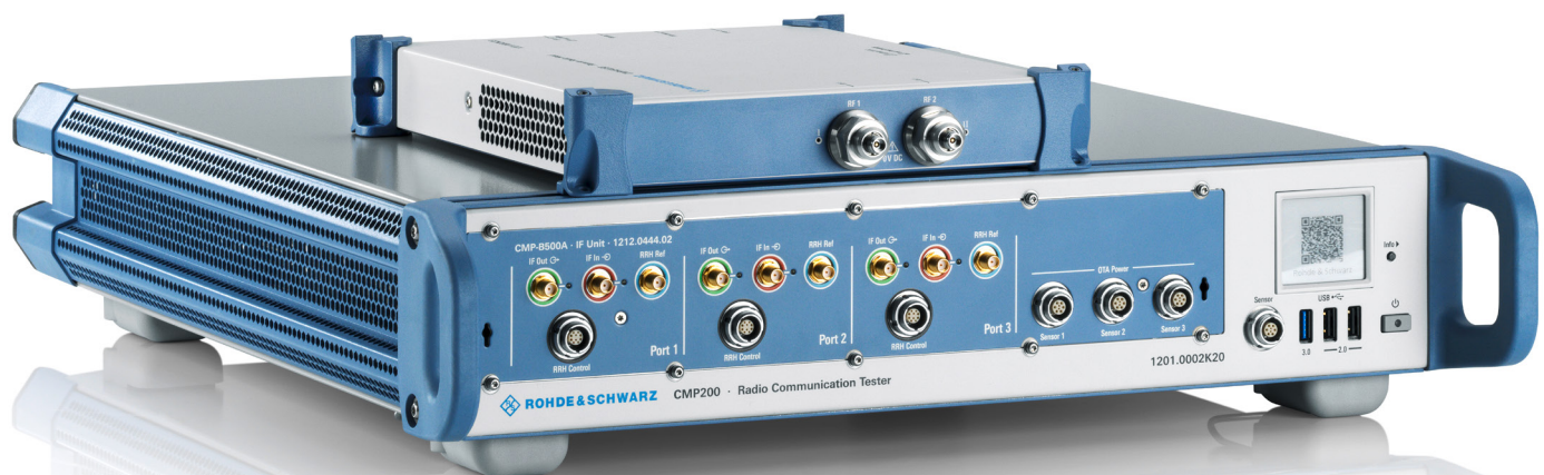
R&S®CMP200 with R&S®CMPHEAD30 on top