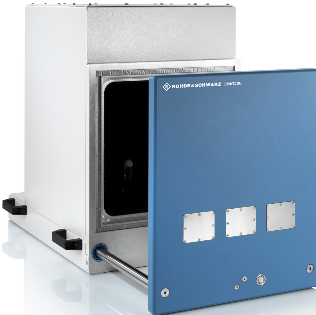
R&S®CMQ200 with open drawer